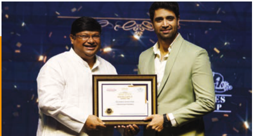
Best Commerce Educational Institution Times Education Excellence Awards - 2022.