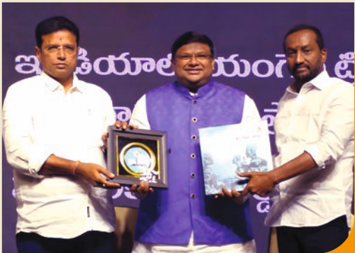
“EDUCATIONIST OF THE YEAR AWARD”