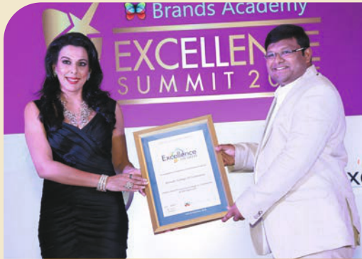
“INDIA’S MOST PROMISING COLLEGE IN COMMERCE & MANAGEMENT”