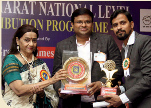
“NATIONAL EDUCATION EXCELLENCE AWARD”

National Education Human Resource Development Organisation (NEHRDO)