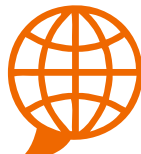
French Foreign Language