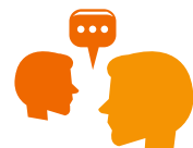
Mentorship & Training