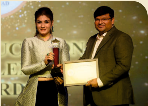
“TIMES EDUCATION EXCELLENCE AWARD (CA TRAINING)”