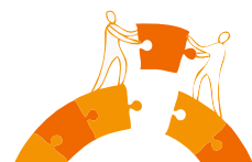
Industry Academia Interface